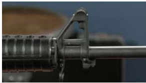
Standard Front Sight Base

With this mount system you have the choice of using a standard A2 front sight base or an alternative style gas block. If you choose an alternative gas block there are also flip up front sights that are calibrated to work with the detachable A2 carry handle or flip up rear sights.